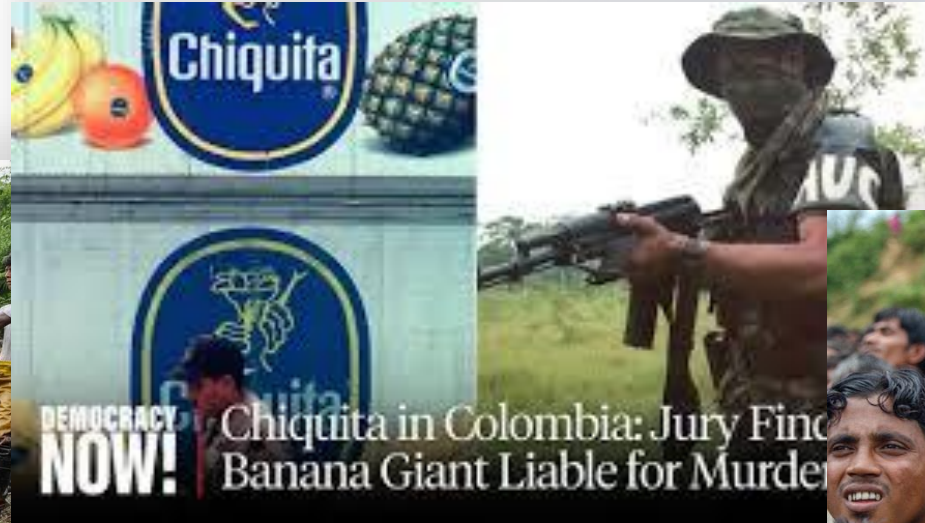
Chiquita Brands company, Colombia