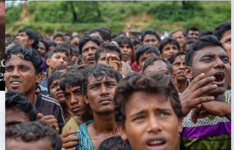
Rohingya genocide in Burma