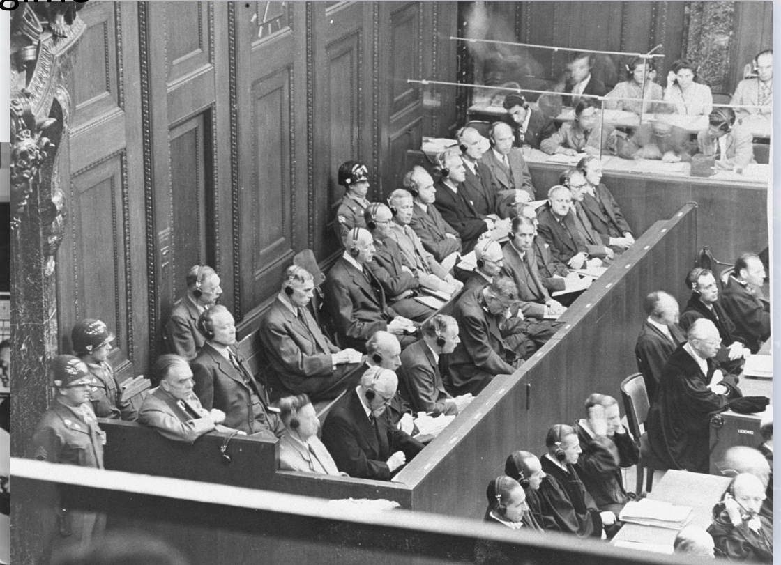
IG Farben, 1947-1948