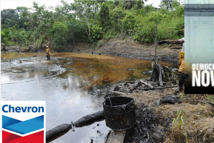
Chevron company, amazon forest