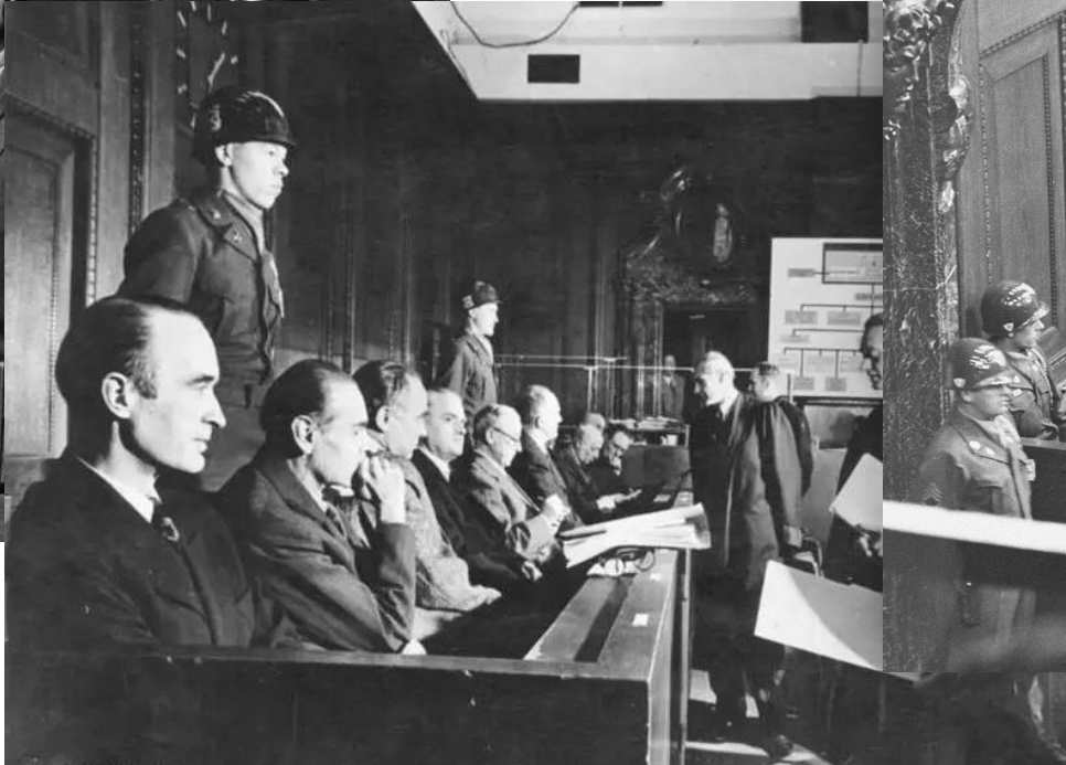
Alfried Krupp, 1947-1948